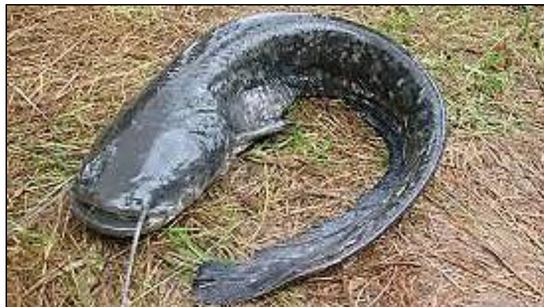
Catfish — Silurus glanis .

The percentage for the ratio of head length (%): io — 49,08 \pm 1,03 ; o — 6,24 \pm 0,19 ; po — 58,71 \pm 1,07 ; hc — 52,71 \pm 1,07 ; r — 23,87 \pm 0,49 ; lr — 48,04 \pm 0,84 .