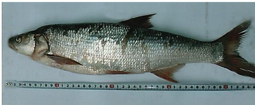
Southern Caspian Asp — Aspius aspius subsp. taeniatus

Asp. A. aspius subsp. taeniatus (Eichwald, 1831). Besides creating a local population in the Nakhchivan Reservoir, local forms are also widespread in the Aras and Arpachay rivers. The local form of asp is important for fishery only in the Nakhchivan reservoir. Currently, it is spread in all areas of the reservoir.