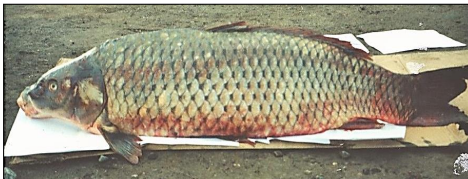
Common carp — Cyprinus carpio

The morphological features of carp in Nakhchivan water reservoir are characterized due to their meristematic and plastic omen indicators. The plastic and meristematic omens were calculated based on the ratio of average value of biometric measurements done over 50 fish samples (13 females, and 37 males) to the body length in %. No sexual dimorphism was found between female and male individuals neither in our studies nor other conducted research works [12, 14].