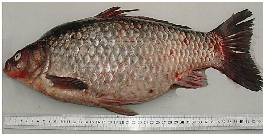
Silver Crucian Carp — Carassius auratus subsp. gibelio

Crucian carp is widespread almost all over the water reservoir; it is especially dense in the shallow areas where the bottom is silty and higher aquatic plants are developed intensively. In 1977–1987, it was among the last positions in important fish hunting via fishery artels. However, its portion increased up to 256 tons in general fish hunting during 1990-2000, thus taking second place [1, 4, 10].