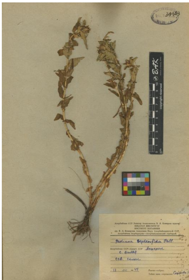
Figure 2. Gentiana septemfida Pall.

In Azerbaijan, it is distributed in GC (Guba), GC east, GC west, and other areas. Its new distribution range was found in the LC north, Gadabey area (Figure 3).