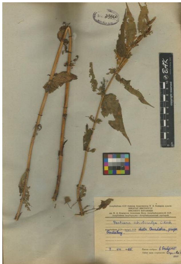
Figure 3. Gentiana asclepiadea L.