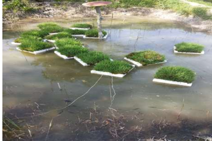
Figure 1. Artificial "Floating Platforms" Created for Cocoon Deposition

In laboratory conditions, leeches kept at 18–22°C in winter and 24–27°C in summer were able to produce cocoons every 6–8 months. Each cocoon typically contained 15–20 embryos (most commonly 8–15). The cocoons had an average length of 20 mm, a width of 16 mm, and were spherical gray in color.