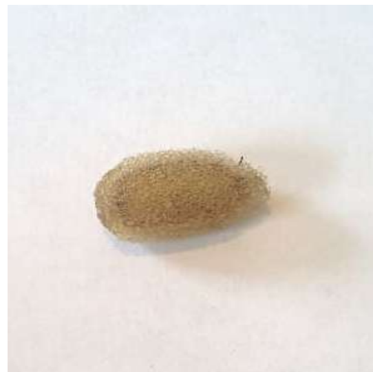
Figure 2. Cocoons of Hirudo orientalis